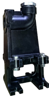
Coupling Foot 801985