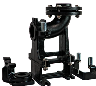
Coupling Foot 801985